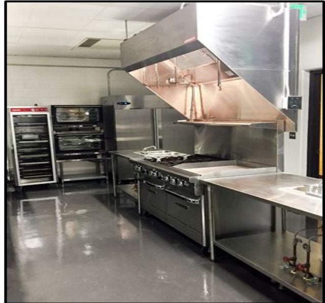
Opening of Crispin's Kitchen – 10/17