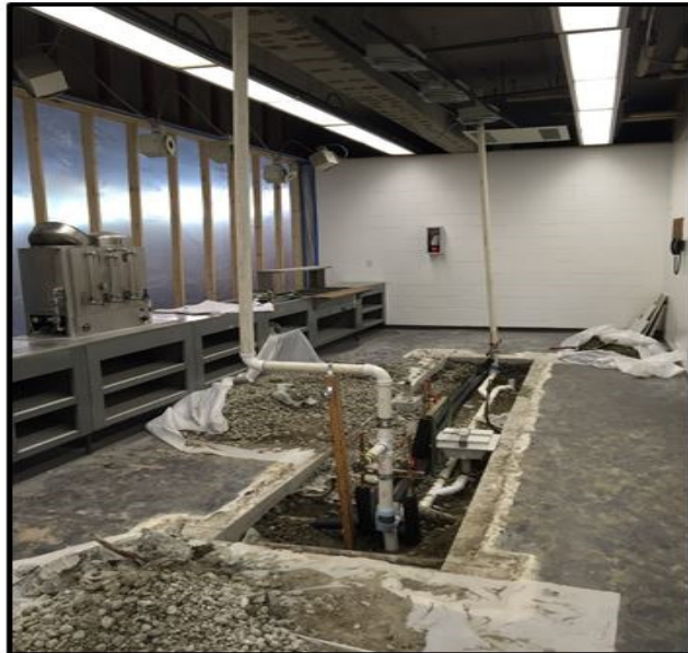
Work in progress - 6/2017